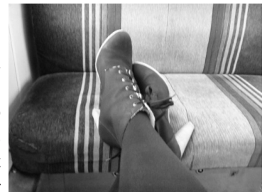
Denver's LightRail: Significantly more comfortable when free to ride.

For those that never ride it, the basics. The Light Rail is run on an enforced honor system... that is, you are "expected" to buy a ticket on the machines but you don't have to get past anyone to get onboard (rumor has it that sweetened coffee down the coin slot can make them inoperable, but that's unconfirmed). <<<cont. pg. 7