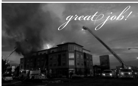
The Penny Flats condo complex in Ft. Collins burns well into the next morning.

The good effects of these new, planned projects are completely canceled out by the elitist force that makes it possible, and every aspect of the development must taken as part of the same whole and regarded as a tool of inequality and class oppression. The mayor and the developers don’t care if the volunteers of a non profit regard themselves as socialists, if an artist whose work is displayed in a gallery is an anarchist, or if some of the people they rent condos to come from poor backgrounds or would like to see the neighborhood keep its character. To them, every bit of their development is nothing but a tool for profit and power, for egalitarians and anti-authoritarians, it is nothing but another target.